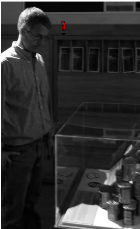
Fig. 4: When light fixtures are angled improperly, museum visitors cast shadows on the displays.

In museum lighting, the number of electrical circuits required is based on light control rather than load. Each zone should be fed by two circuits, one for artifact lighting and the other for general lighting. Those dual controls will enable you to limit light exposure for displayed artifacts and, at the same time, maintain a comfortable viewing environment for visitors.