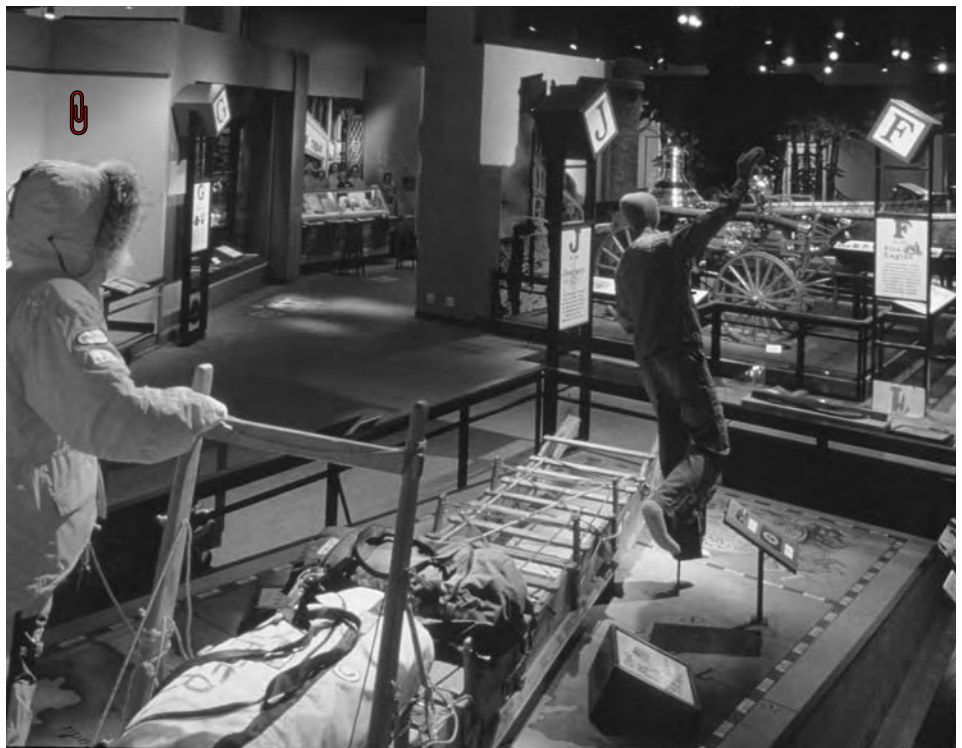
Fig. 3: Used effectively, track lighting creates visual interest by varying light levels throughout the exhibit.