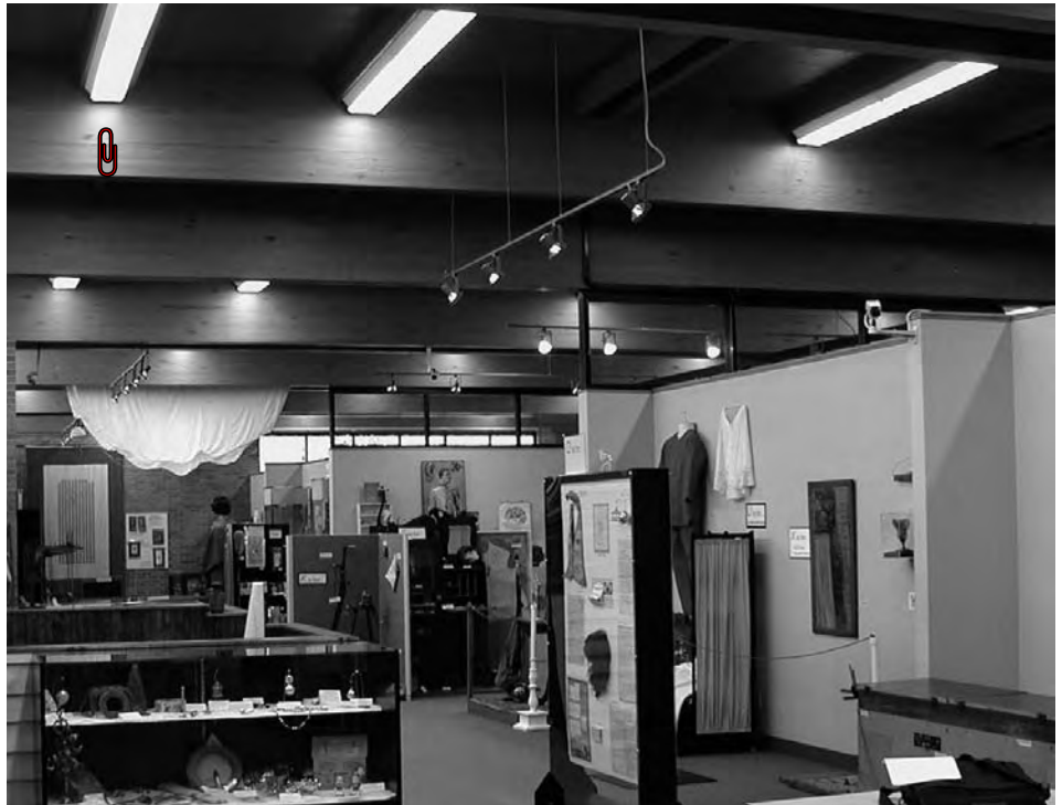
Fig. 2: Overhead fluorescent fixtures create a flat, even light. The track lighting used here provides more light but adds little visual impact.

Each manufacturer makes durable, two-circuit track and a variety of fixtures designed for long-term museum lighting. They must be special-ordered; work with a local manufacturer’s representative to view samples, then arrange orders through your electrical contractor or supply house. These brands are more expensive than standard commercial track or retail-grade track, but you get the quality you pay for. For contact information, go to www.mnhs.org/techtalkresources .