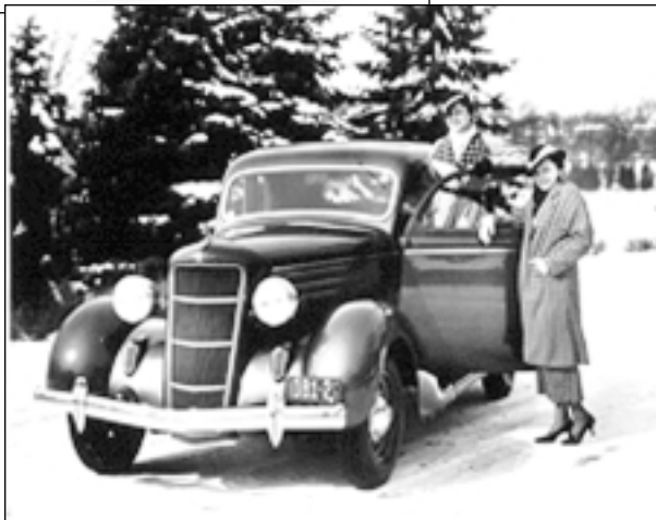
MHS collections: photograph by Norton & Peel